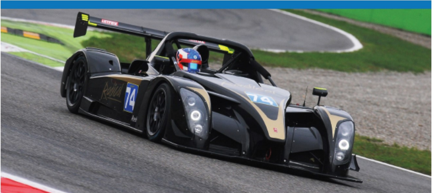
Radical RXC Spyder Turbo RACE